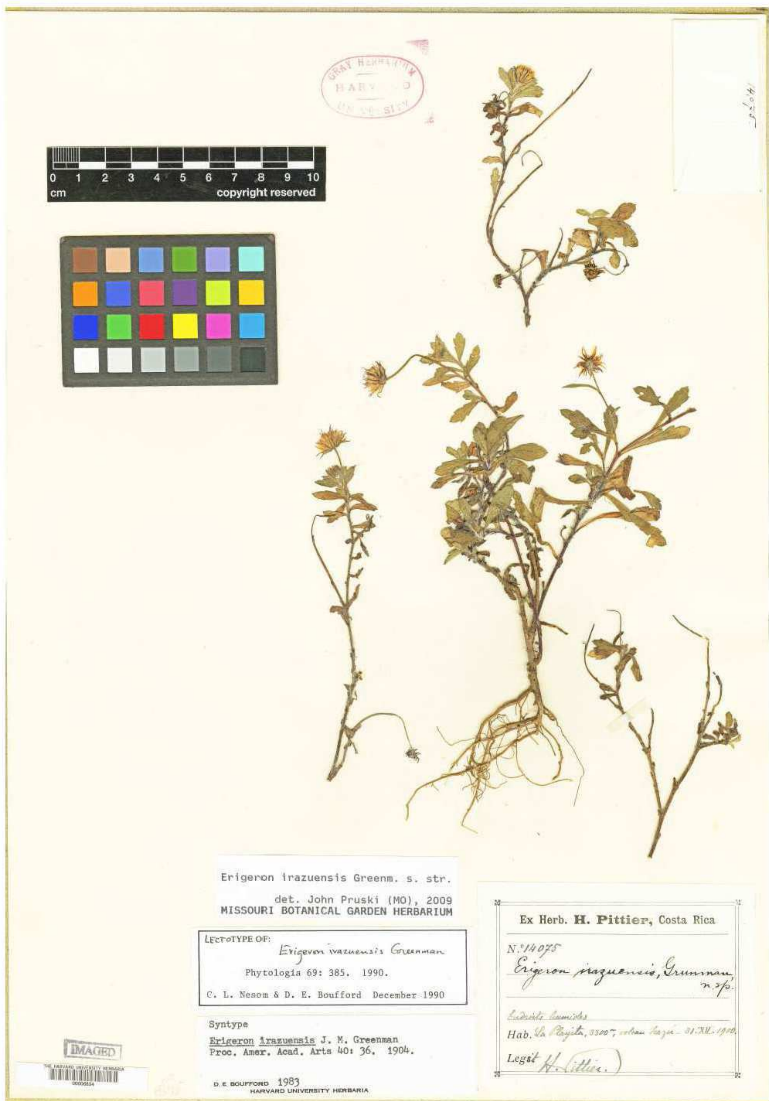
Figure 2. Holotype of Erigeron irazuensis (GH).